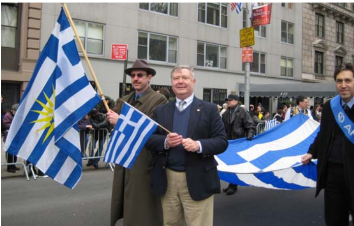
Lt. Governor Nick Nikas carries the flag