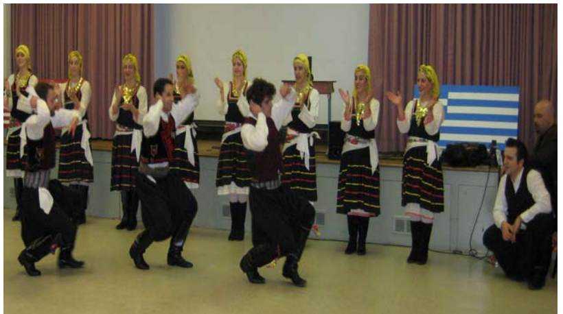
Right: The Stamford Church Dance Group performs