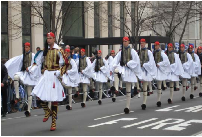
Evzones march on 5th Avenue