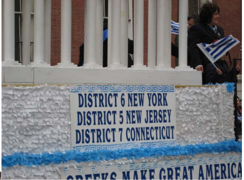
The AHEPA Float