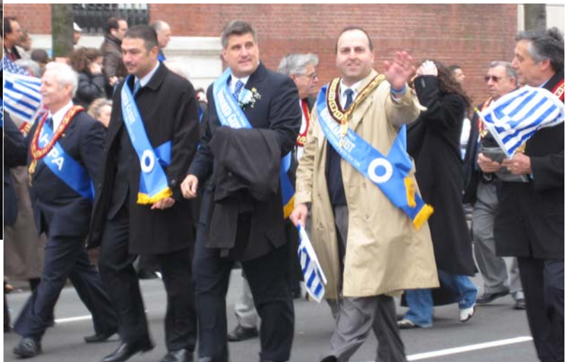
AHEPA Supreme Lodge members lead the AHEPA delegation